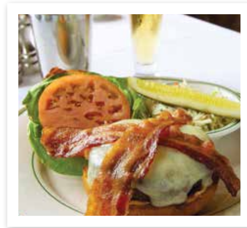
Wollensky's Butcher Burger* with thick-cut bacon and cheddar cheese on toasted Brioche roll