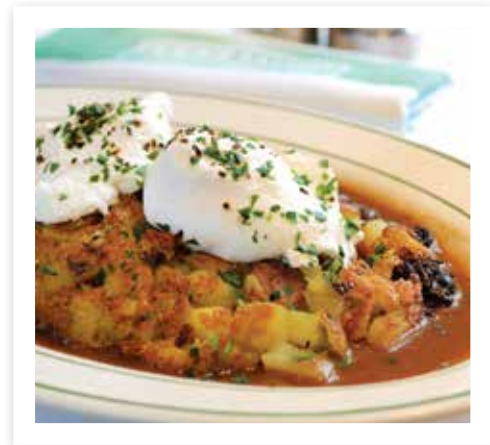
Braised Rib Hash & Poached Eggs* with au poivre sauce