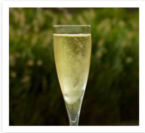
Champagne & Sparkling Wines