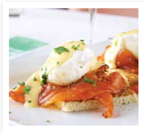
Pastrami Salmon Benedict* sliced house-cured salmon with poached eggs and Dijon hollandaise on marble rye toast