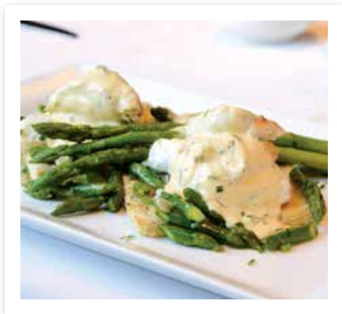
Benedict Oscar Style* poached eggs, sautéed colossal crab meat, asparagus and béarnaise sauce on marble rye toast