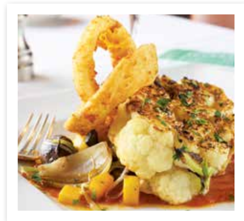
Broiled Cauliflower Steak Smith & Wollensky steak sauce mayonnaise, roasted winter vegetables, smoked tomato sauce and buttermilk onion rings

* Consuming raw or undercooked meats, poultry, seafood, shellfish or eggs may increase your risk of foodborne illness.