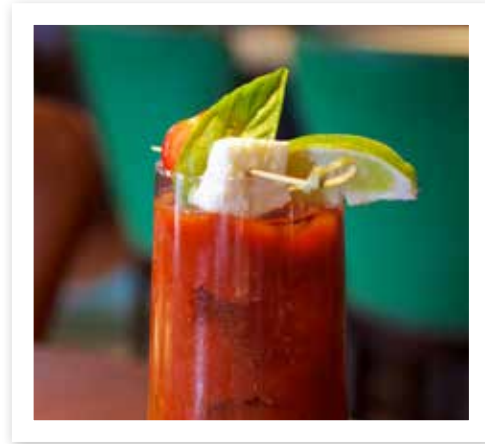
Gazpacho Bloody Mary Effen Cucumber Vodka, Absolut Peppar and Gazpacho