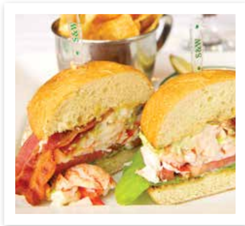
Lobster BLT applewood-smoked bacon, lettuce and tomato